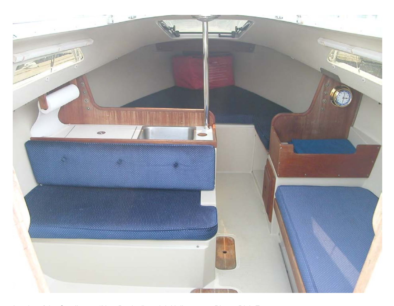
Interior of the Catalina 22 "New Design" model. Hull #14411.

As a racing boat, the New Design was rarely a performer in the Class. A short time after its introduction, the boat was identified as heavier than the original Catalina 22 and discouraged most racers from purchasing the boat.