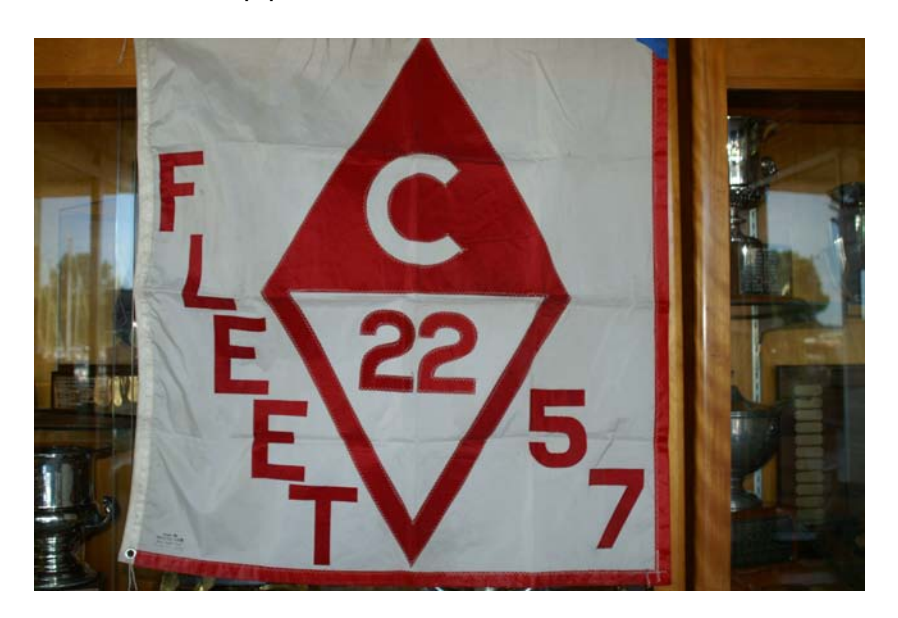
Fleet 57 Banner.

Fleet Development – The Association makes it easy to start a fleet in your area and to enjoy organized sailing activities with other Catalina 22 owners. Simply find three Catalina 22 owners, have each join the Association, submit a Fleet Charter Application, then utilize Association resources to help promote Catalina 22 cruises and races.