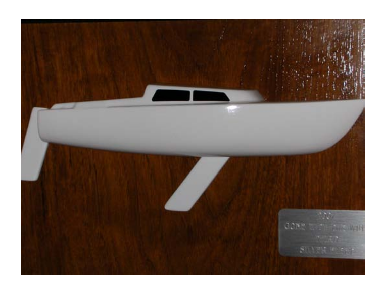
Regattas – The Catalina 22 class has a very active racing calendar that includes regattas at the local, regional, and national level. Membership in the Association is a requirement to participate in the Catalina 22 National Championship Regatta. This annual event attracts at least 40 to 60 Catalina 22s and their skippers and crew from across the United States each year.