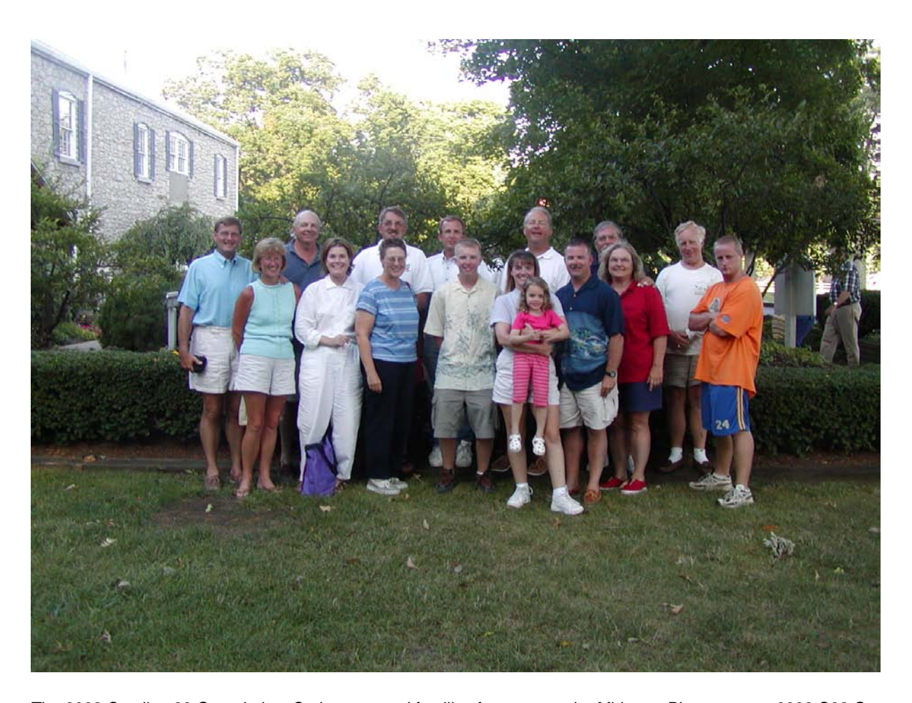
The 2002 Catalina 22 Great Lakes Cruise attracted families from across the Midwest.