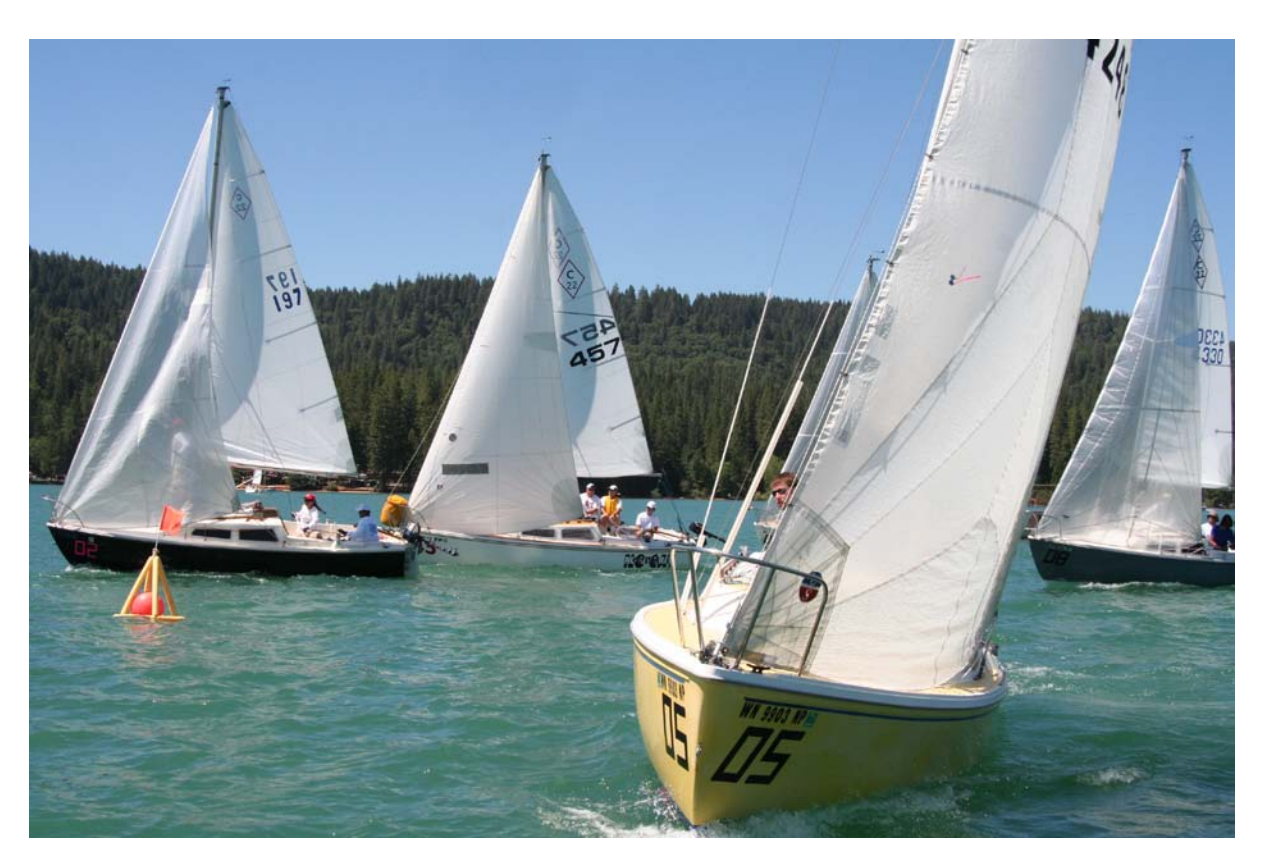
2006 Catalina 22 National Regatta at Scotts Flat Lake, California.

Each year, members of the Catalina 22 National Sailing Association vote for the host fleet/club of the following year's National Championship Regatta. The C22NSA member who represents the elected fleet/club serves as Vice Commodore on the C22NSA Board of Directors.