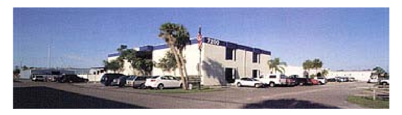
Catalina Yachts – Largo, Florida Office and Manufacturing Plant – this is where Catalina 22s are built today beginning with the 2010 model year.

Catalina Yachts has a bright future given the thousands of loyal customers sailing its products around the world. The international class associations for the C-22, C-25, C-27 and C-30 are among the largest sailboat groups in the world.