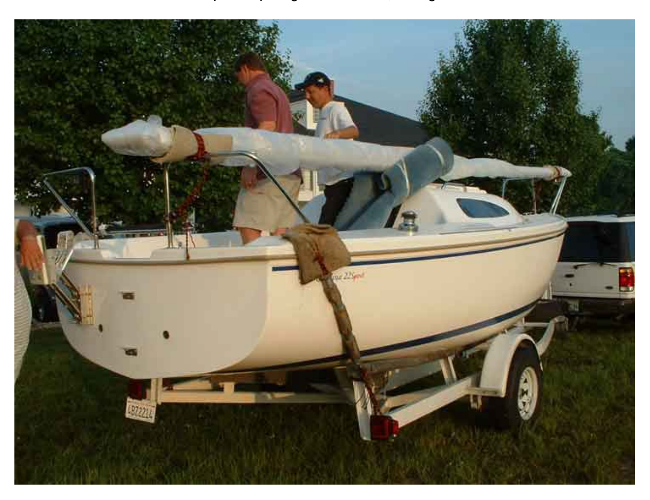
The first Catalina 22 Sport, hull number 15540, arrives at Lake Lanier immediately following the 2006 Catalina 22 National Championship Regatta.

In June 2004, the first Catalina Sport, hull number 15,540, made its debut immediately following the Catalina 22 National Championship Regatta in Atlanta, Georgia.