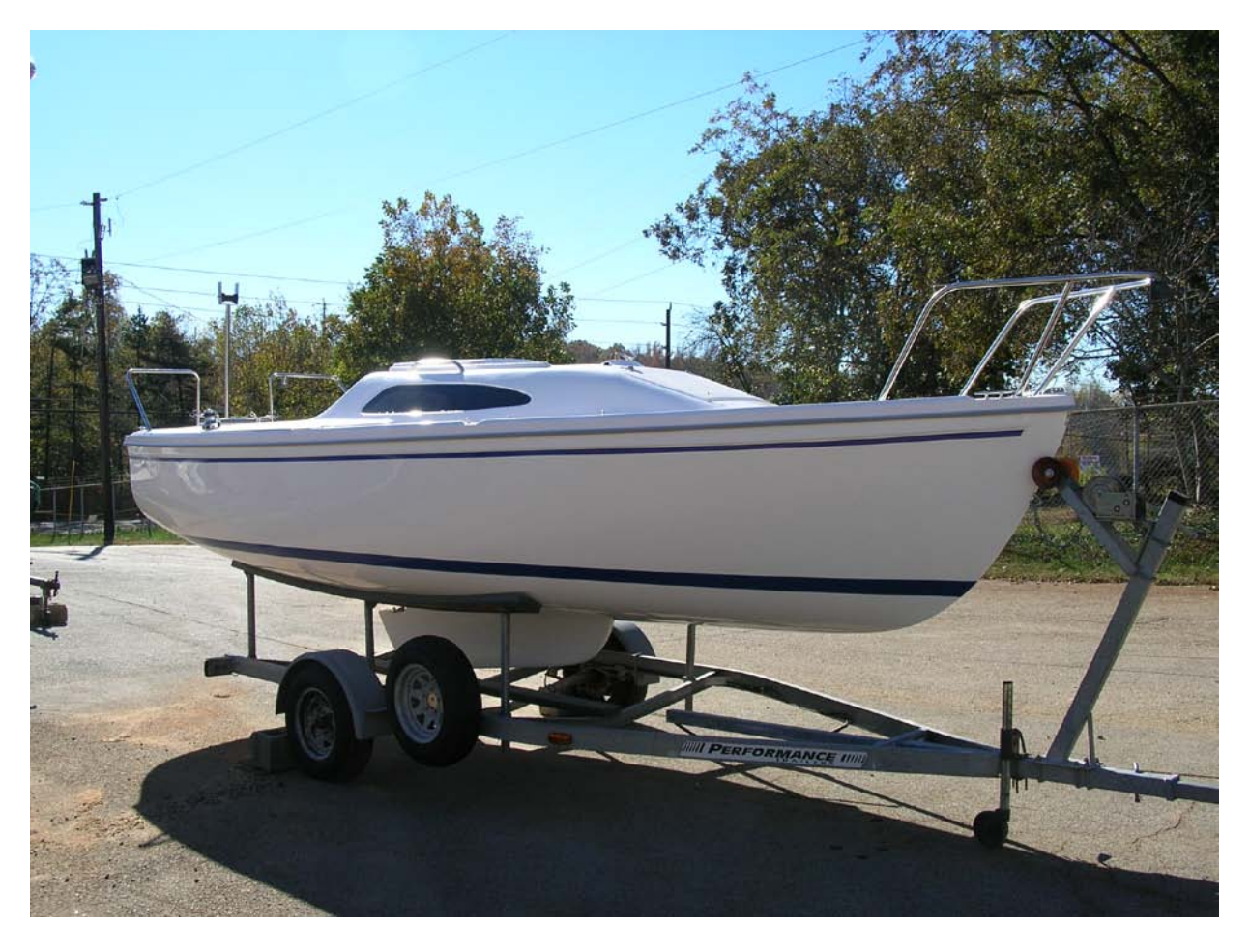
Hull # 15592 arrives at Weathermark (dealership) in Atlanta.

When first viewing the Catalina 22 Sport, it is easy to mistake the boat for a Capri 22. The Catalina 22 Sport is built from the same hull mold as the original Catalina 22. However, the deck, cabin trunk, and interior are nearly identical to the Capri 22 MkII. The Capri MkII was the first Catalina sailboat produced with the new design incorporating a more round window. The Catalina 22 Sport was the second model.