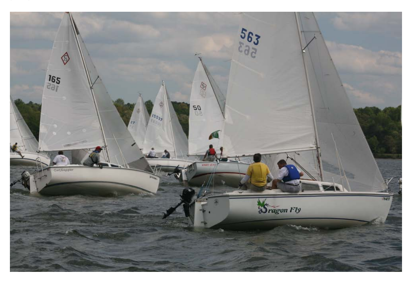
A competitive start at the 2008 Chattanooga Challenge.

The boat, designed as a family cruiser, came equipped with a main and 110% jib. That didn't last long as racers wanted more speed. The 150% Genoa was added to the sail inventory and the class rules were adjusted. One design racing in the Catalina 22 was off and running. In 1975 the weak point of the boat showed up drastically at the Nationals, held on Lake Ray Hubbard in Dallas, Texas. At the start of one of the races, with high winds blowing, several of the masts came down. Due to a lack of tuning to accommodate the larger 150% head sail, excessive mast pumping caused the cast aluminum spreader brackets to fail. Since the boat was originally designed to carry a 110% headsail, no thought had been given in the beginning that a larger headsail would cause undue stress on the rigging. At that time the forward and aft lowers were only 3/32" wire, not strong enough to handle the extra loads created by the 150% Genoa and high winds. This incident began the search for a tuning guide to solve this problem. The final solution was to change the wire to 1/8", the same as the uppers, and to replace the aluminum spreader brackets with stainless steel spreader brackets. Eventually a new mast extrusion was developed which gave the mast more rigidity. These changes eliminated the problem of mast pump and failure.