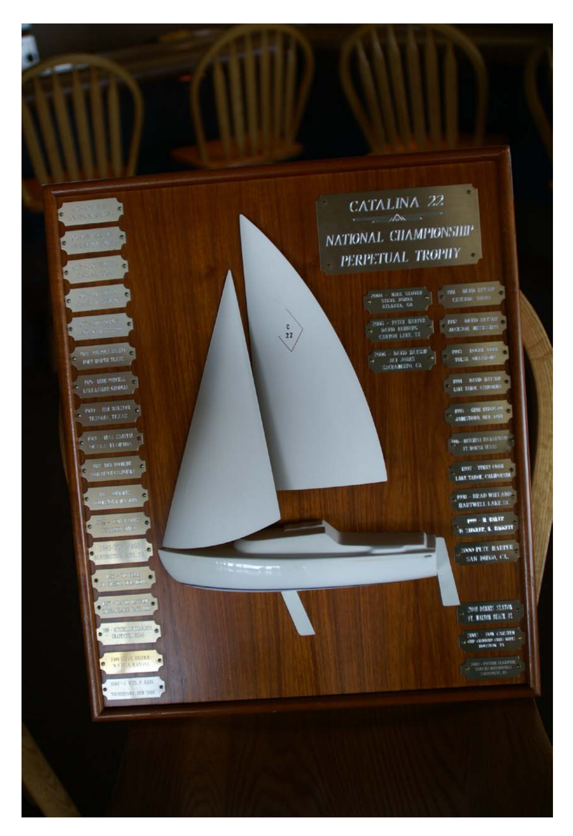
Catalina 22 National Championship Perpetual Trophy.