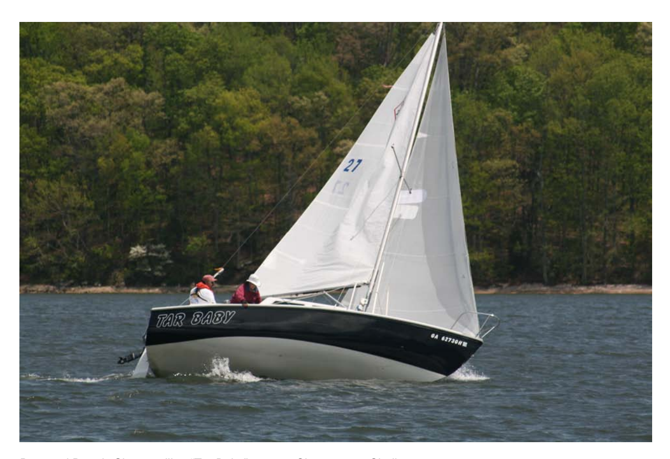
Pam and Dennis Slaton sailing "Tar Baby" at 2008 Chattanooga Challenge.