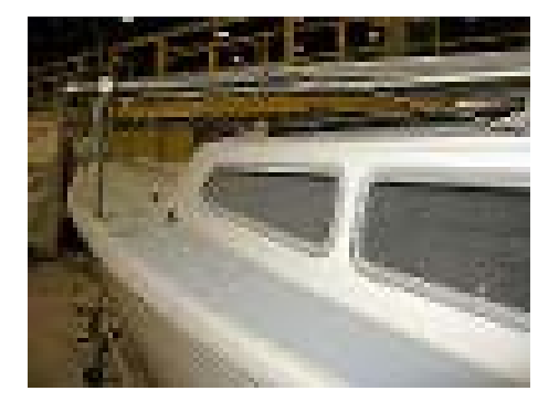
Catalina 22 Hull #1 at the Catalina 22 Woodland Hills factory.